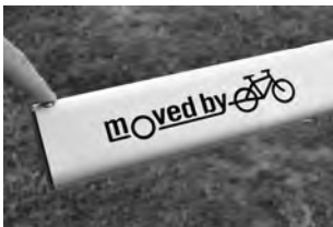
Extend rack's main tube to its full length. (Push gold button near logos and push IN on end cap at logo end of rack. Inside tube will extend out other end.)