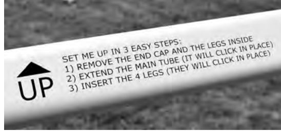
Instructions are printed right on the racks for quick and easy assembly and use.