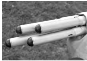
Pull out the four support legs and replace end cap. (Note: Racks ship with one banner mast nested between the four legs.)