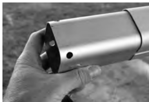
Extend the rack until the push button locks in place at its fully extended position. (instructions continued on back...)