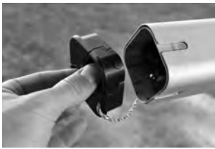
Remove the end cap (squeeze the two finger slides together to release).