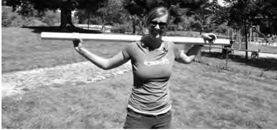
Packed up, the racks are extremely compact and easy to transport.